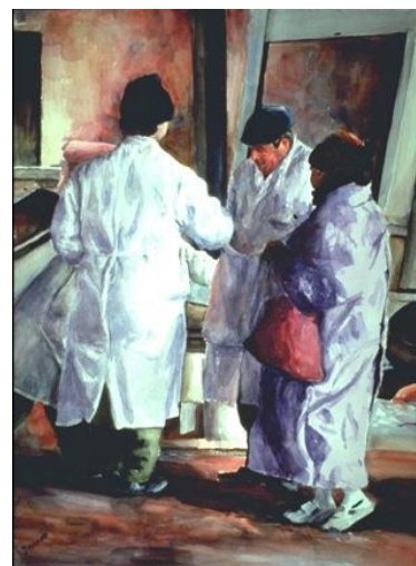
"Market Study" by Ted Duncan