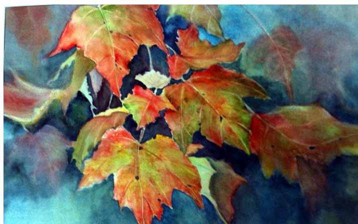
Canadian Fall 2