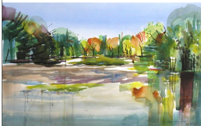
"Petrie Island Fall" by Rosy Somerville

Montreal May 17 to 26 2013 - Maison Ogilvy Alma June 1 - 9 th Odyssey Building Quebec City June 15 th - 23 rd - Library C. H Blais Granby - July 3 rd to 28 th Boréart Centre Sherbrooke - Aug 2 nd - 24 th - Cultural Centre Nicolet - Sept 18 th - Nov. 10 th Museum of world Religions