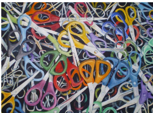
On The Cutting Edge by Patricia Smith

In accordance with its established formula since the 1980s, this event will bring together about 100 watercolors by guest artists and members of the SCA. In most cities where it will stop, admission is free. The public can enjoy complementary activities that will enable it to enhance its visual experience. The local members of the SCA and their colleagues and local counterparts will conduct demonstrations of watercolor for visitors at each site.