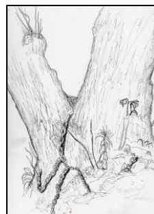
Sketch of a tree with Chains