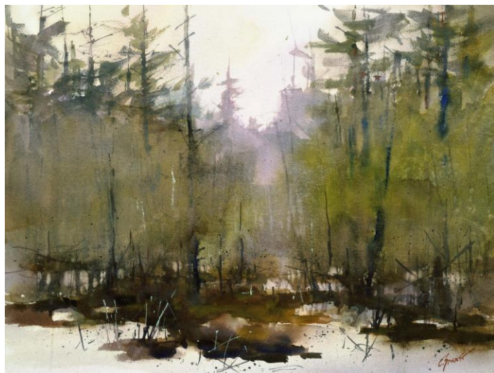
Nature Emerging By Charles Spratt

The show is at the Walter Baker Center and runs from September 7 th , 2013 to November 9 th , 2013 All of the paintings in the show are not listed here. This is a really good exhibit, perhaps this will serve to entice you to go see it in person!